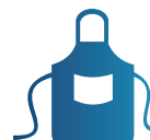
Navy Blue Apron Ksh 500 QTY: 1