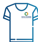
T-shirt QTY: 1