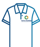
Navy Polo Ksh 1200 QTY: 1