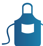
Navy Blue Apron Ksh 500 QTY: 1