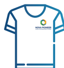
T-shirt QTY: 1