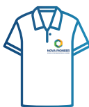
Navy Polo Ksh 1200 QTY: 1