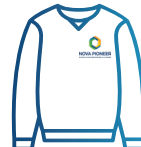
Green Sweater Ksh 1500 QTY: 1