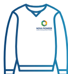
Green Sweater Ksh 1500 QTY: 1