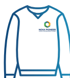
Green Sweater Ksh 1500 QTY: 1