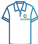
Navy Polo Shirt Ksh 1200 QTY: 1