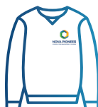
Green Sweater Ksh 1500 QTY: 1